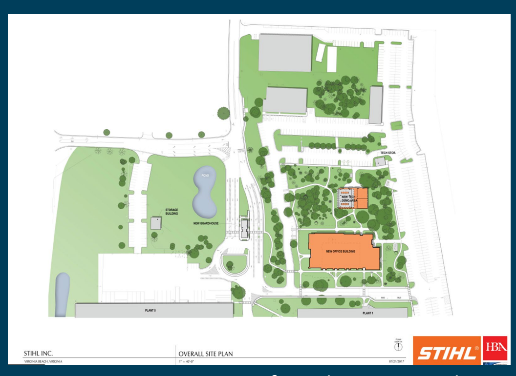
2017 Expansion of Headquarters Facility at 536 Viking Drive