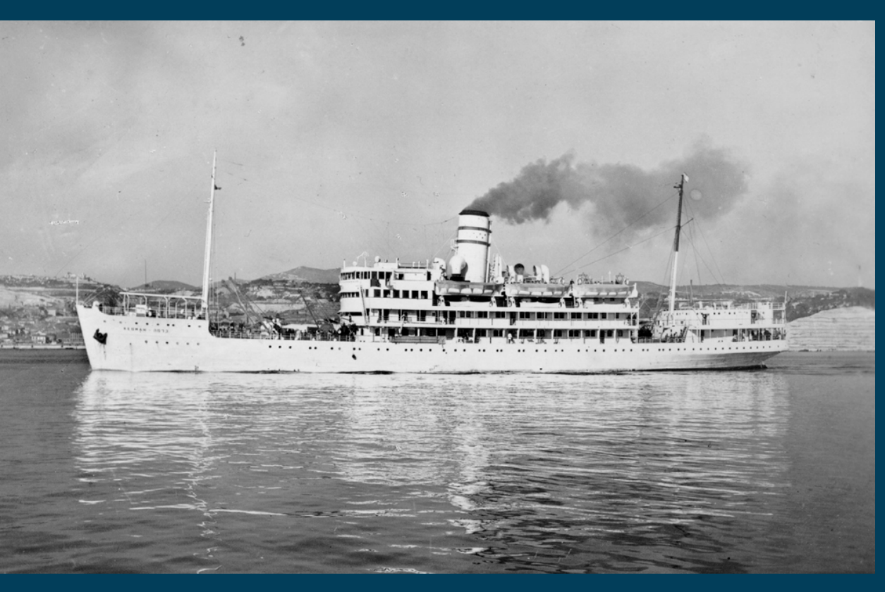
TSS Kedmah, ZIM's first ship, in 1947